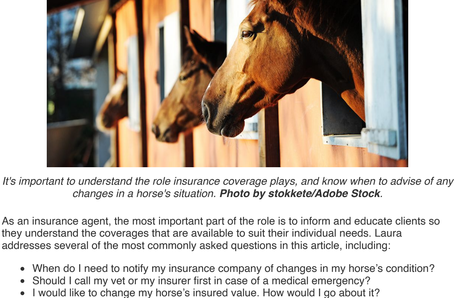
I'm buying a new horse — how does that affect its insurance coverage? What happens if my horse is stolen or needs to be put down?