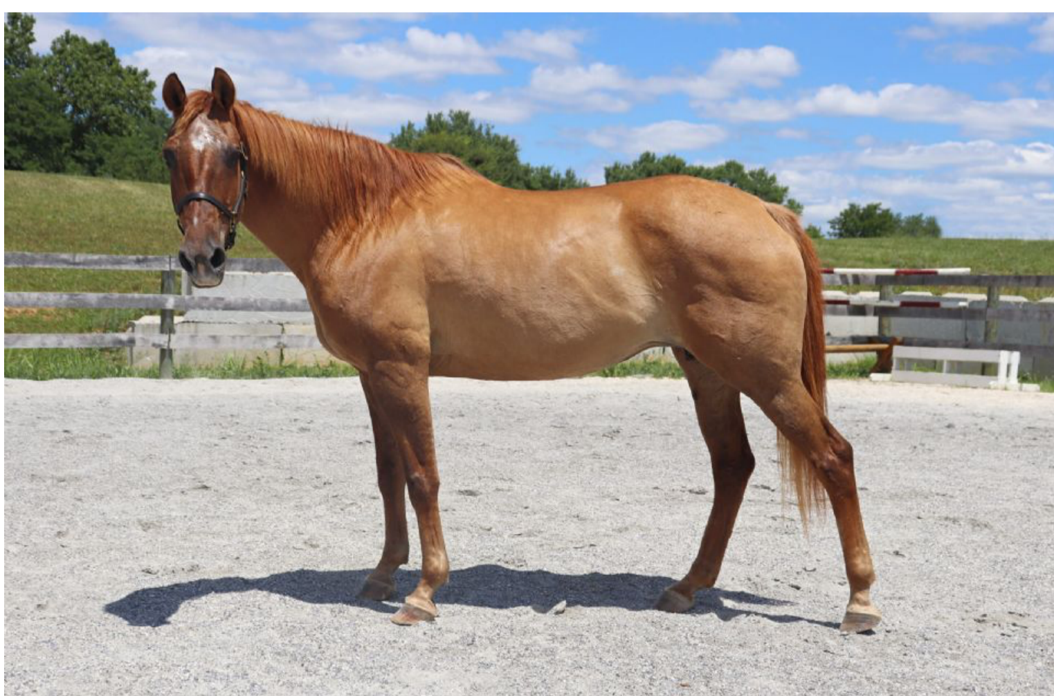
17-year-old Quarter Horse mare, 15hh

"Yuzu" is a gentle mare being offered as a non-riding companion due to arthritic changes. Despite this, she is barefoot and pasture sound. Yuzu is a sweet girl that gets along well with others in her herd and is easy to handle, lead, and groom, making her the ideal companion.