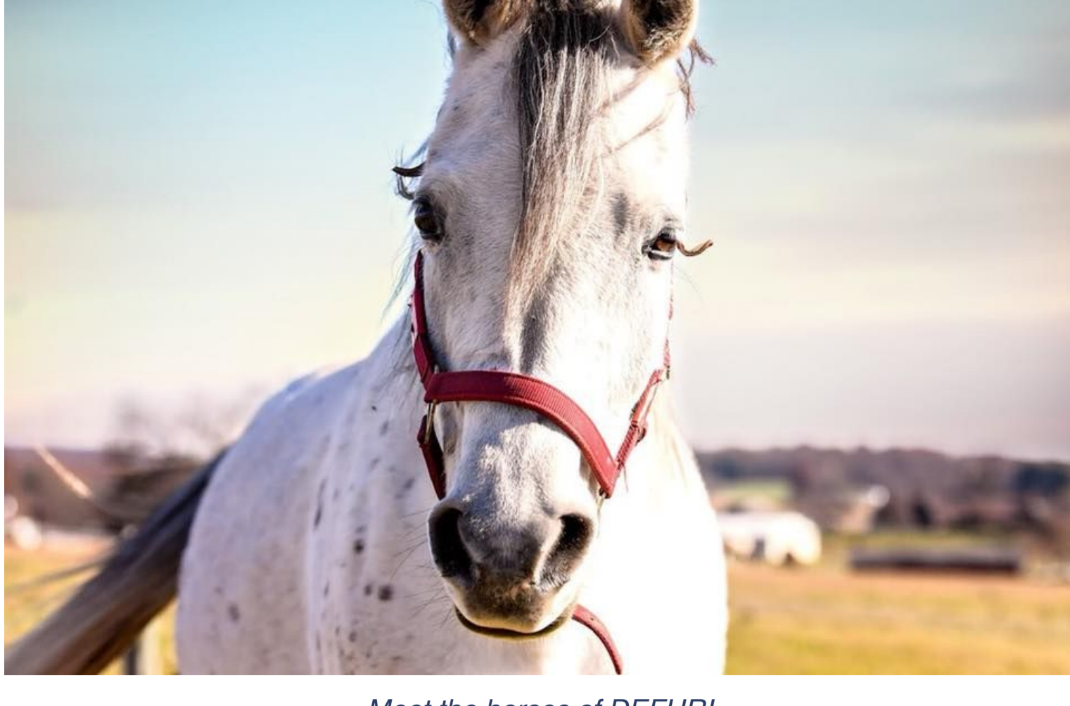
Meet the horses of DEFHR!

Are you making plans for this summer? Whether you have family visiting from out of town or you're simply looking for something fun and free to do, be sure to add a visit to Days End Farm Horse Rescue (DEFHR) to your list.