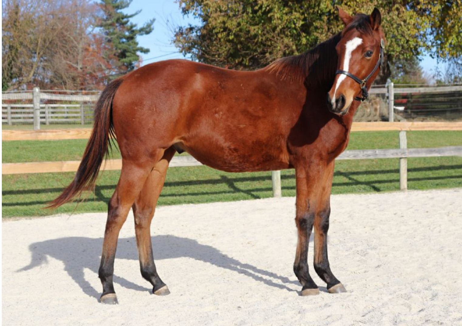
Three-year-old Thoroughbred gelding

Do you dream of bringing up a youngster for groundwork, liberty, or therapy work? In the right hands, Iffy could be all of those things! Unfortunately, he was born with contracted tendons that were not treated at an appropriate time, so he is offered as a non-riding companion. He would be suitable for a home where he can still receive the appropriate education needed to be a good equine citizen. Iffy is a sweet boy; he loves attention and recently started working on some basic groundwork.