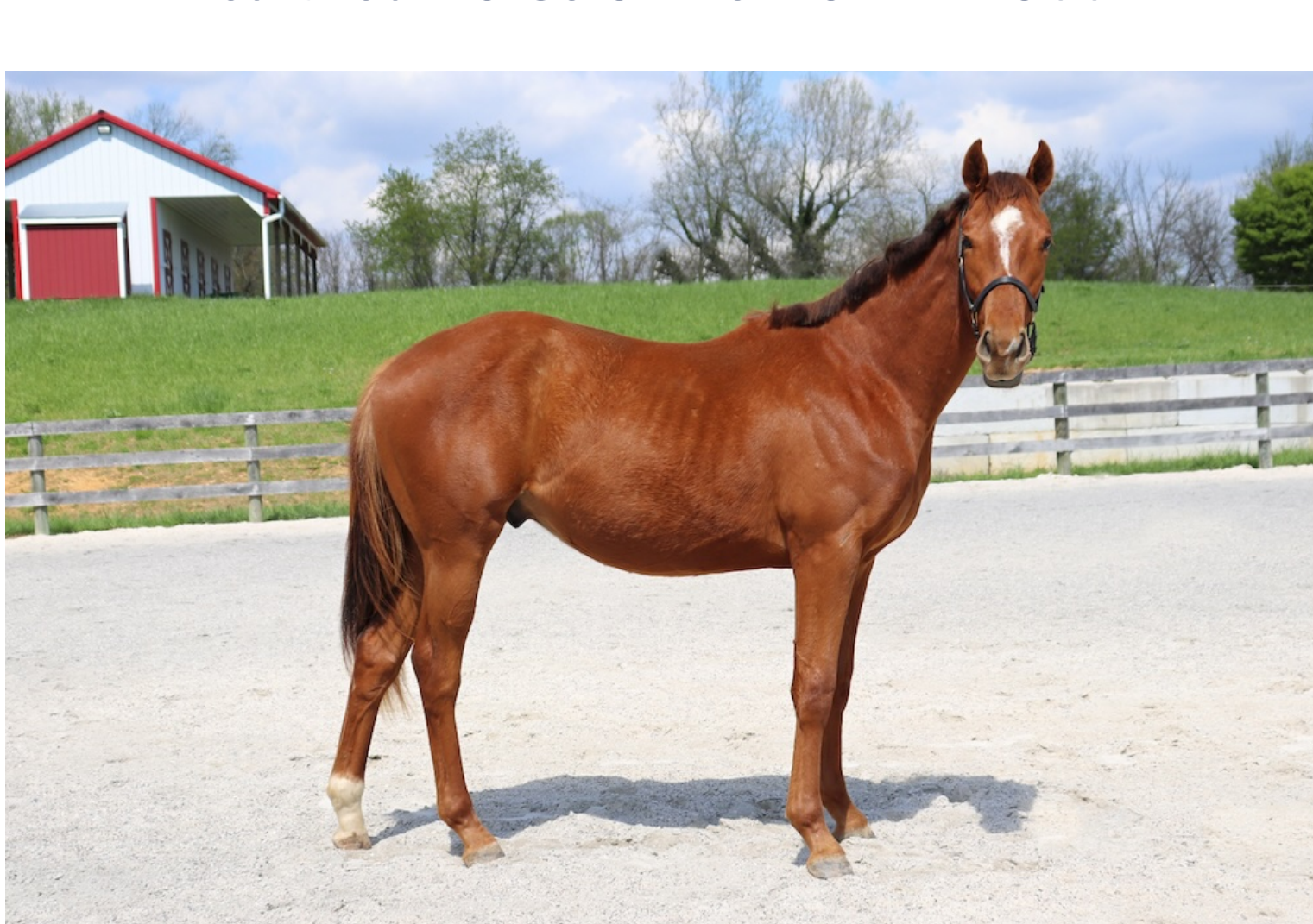
Two-year-old Thoroughbred gelding

Hobbit is a two-year-old Thoroughbred chestnut gelding who is available for adoption. He is a clean slate and ready to take on the world! He has started basic groundwork training, has learned how to lunge, and has started exploring some obstacles like bridges, tarps, and poles. Hobbit stands tied for grooming and bathing, and he behaves nicely for the farrier/vet. Hobbit will need an adopter who has experience with young horses and has a plan to ensure that his education continues appropriately.