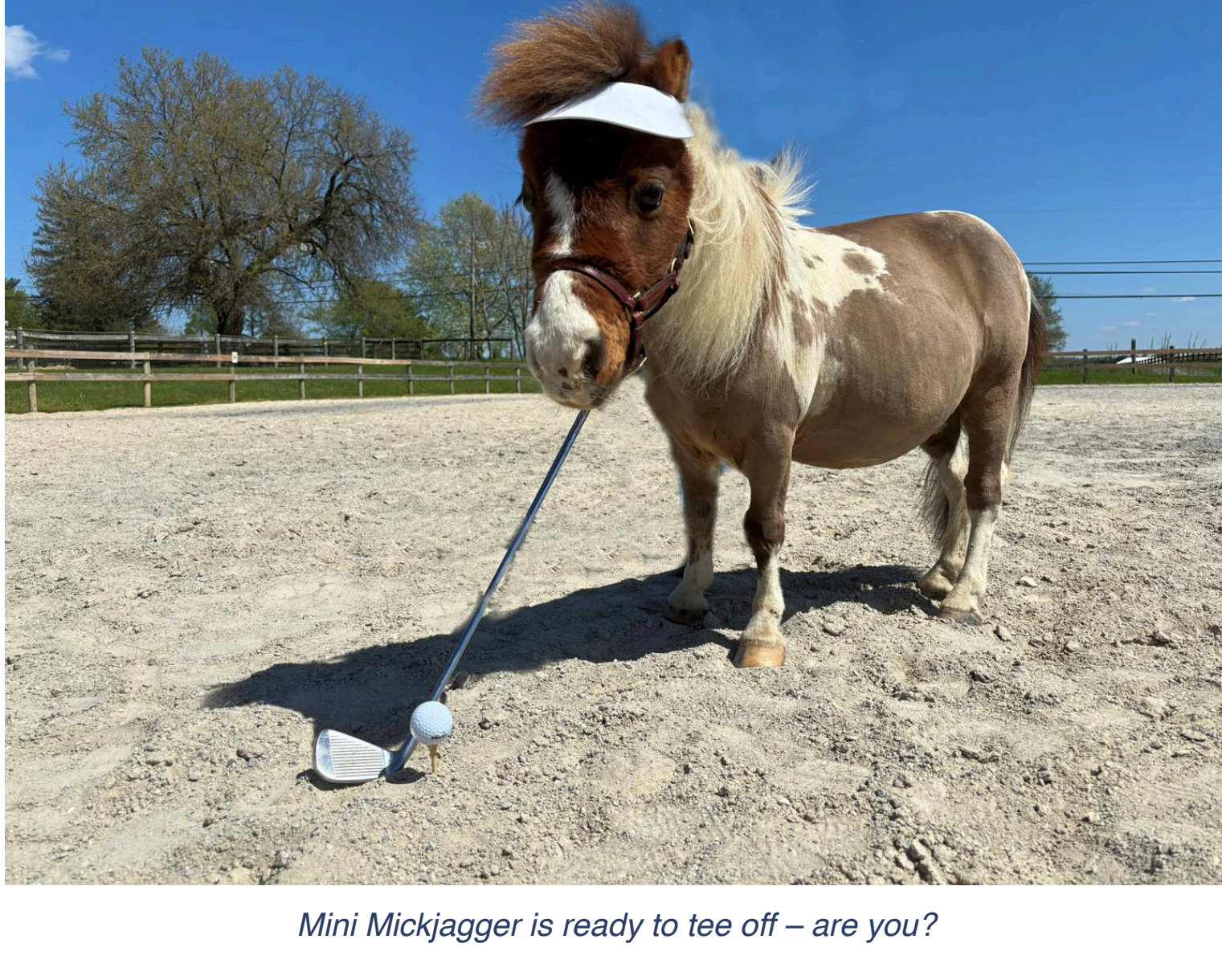
Mini Mickjagger is ready to tee off – are you?

Interested in playing a round of golf and supporting a great cause? Days End Farm Horse Rescue (DEFHR) is holding its third annual Equine Welfare Charity Golf Tournament on Thursday, June 13, 2024, at Worthington Manor Golf Club in Frederick County, Maryland. You can sign up as a single golfer or bring a foursome.