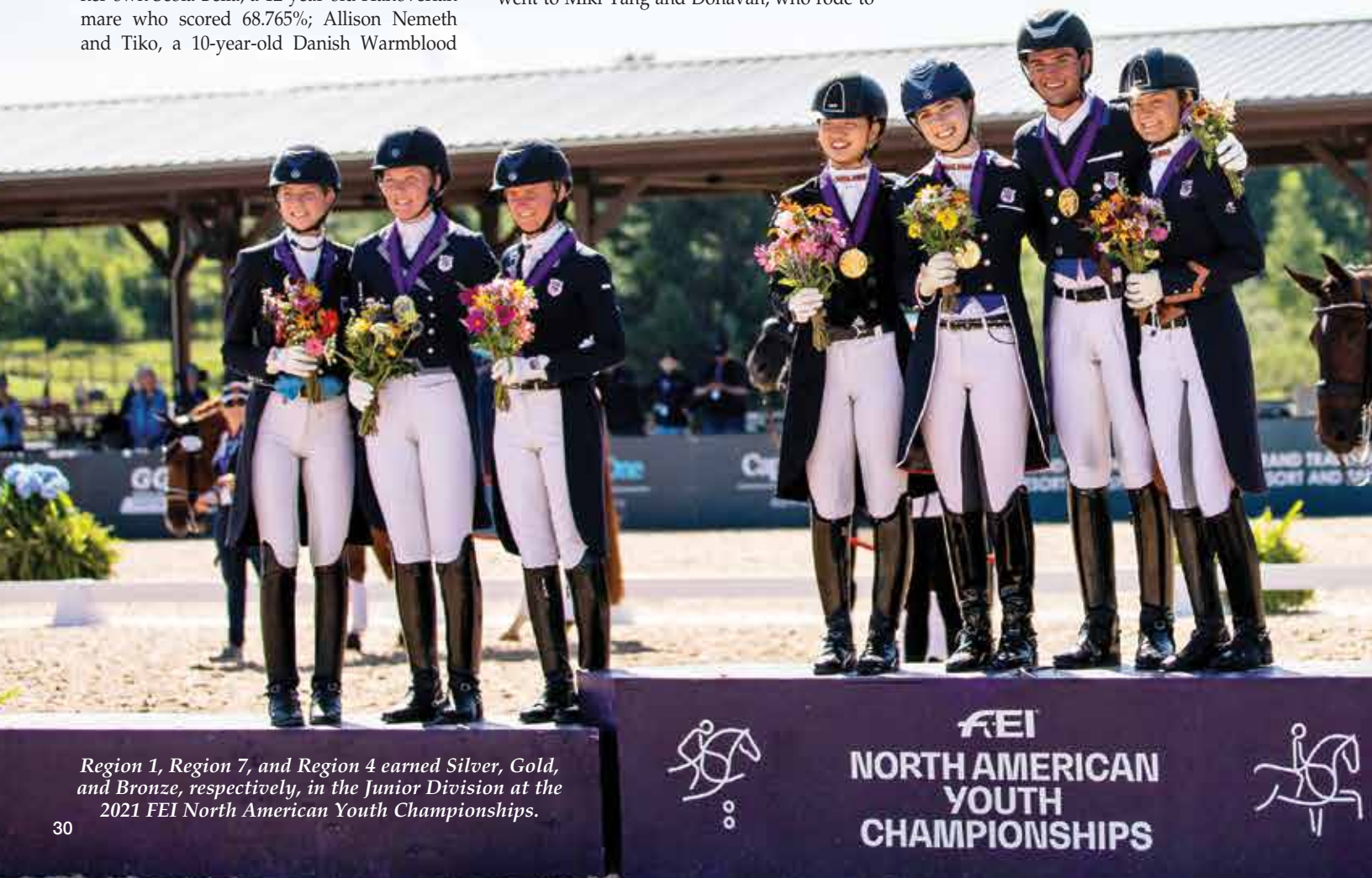
Region 1, Region 7, and Region 4 earned Silver, Gold, and Bronze, respectively, in the Junior Division at the 2021 FEI North American Youth Championships.